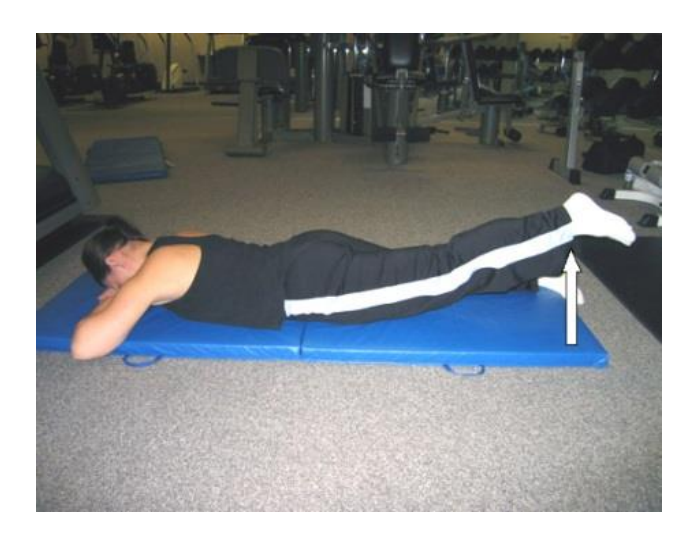
Lie on belly. A small pillow can be placed under pelvis for comfort. While keeping the knee straight, raise leg straight up in the air so that the thigh lifts off the table.

Perform _____ repetitions Repeat _____ times/day