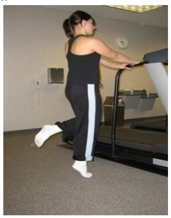
Start with arm supported standing position. Slowly rise upward onto your toes. Repeat ______ times. Repeat _____ times per day.