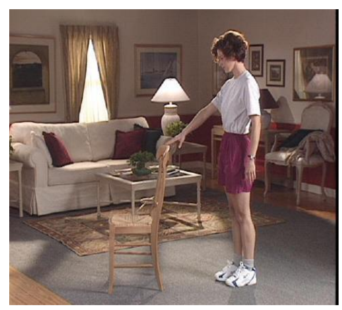
Stand near chair for balance.