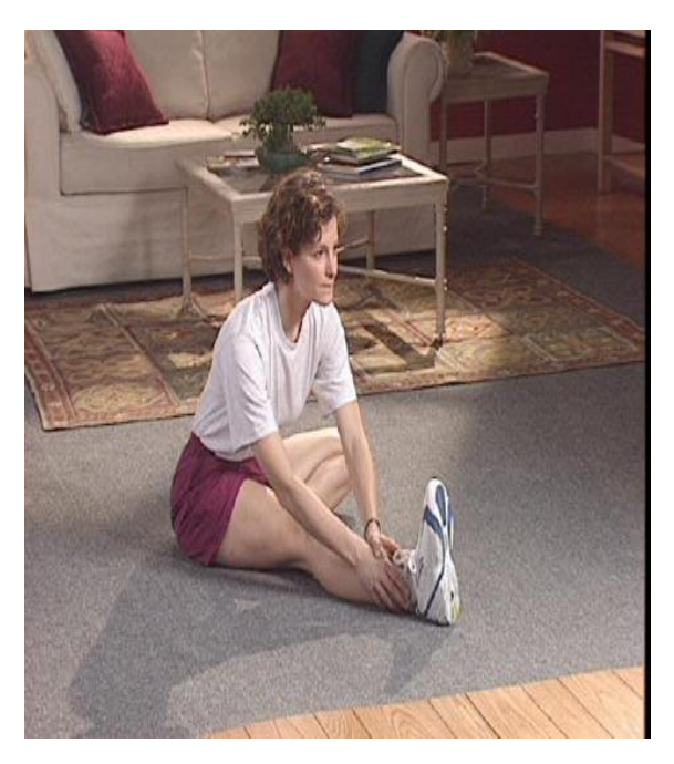
Reach forward toward your ankle.