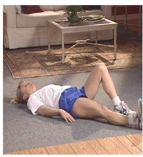
Lie on your back. Bend you uninvolved leg.