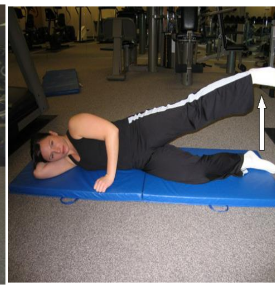
Lie on uninvolved side. Raise involved leg straight up in the air.