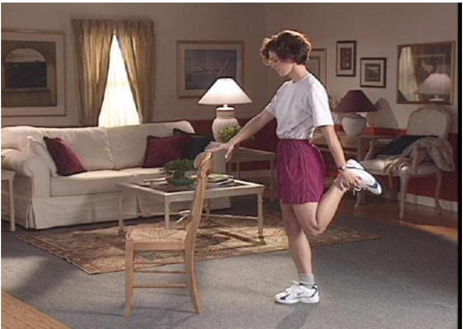
Bend your involved knee and grasp at the ankle Keep your body upright and hips straight.