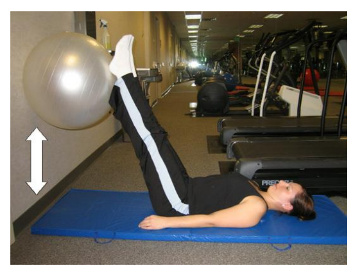
Place feet on the ball, roll ball up and down the wall by bending and straightening your knees. Try to be smooth with motion and maintain control.

Perform _____ repetitions. Repeat _____ times per day.