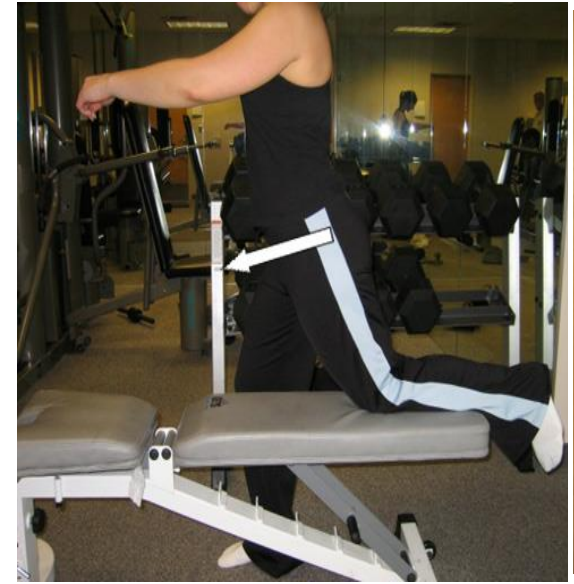
Place knee on bench/chair. Keep the leg you are standing on in front of the knee on the bench and bend knee slightly. Lean forward at your hips. Make sure you don't bend at the waist.