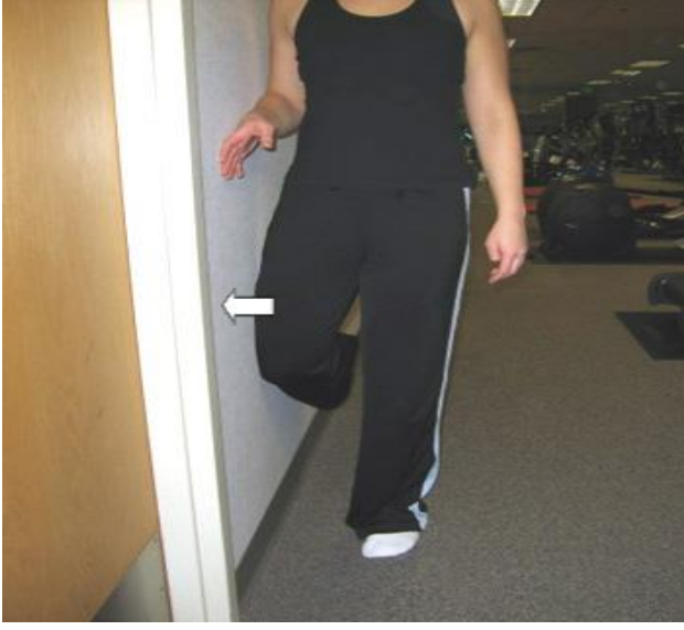
Stand with the lower part of your lateral thigh touching the wall. Bend knee. Push thigh outward into the wall.