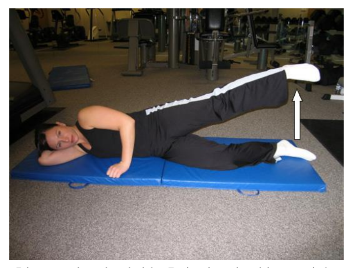
Lie on uninvolved side. Raise involved leg straight up in the air. Perform _____ repetitions Repeat _____ times/day