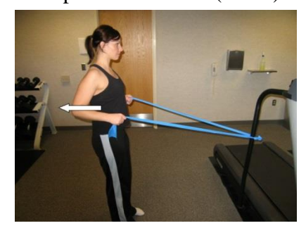
Pull band towards your chest while squeezing your shoulder blades together.