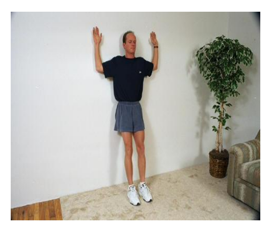
Stand with back and shoulders against wall.