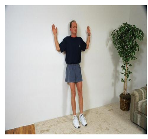
Slide arms toward side.