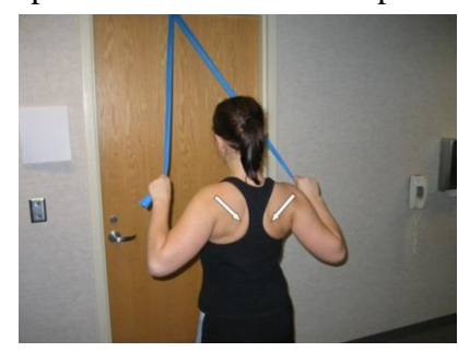
Pull band towards the floor while squeezing Band resisted scapular retraction (rows) with your shoulder blades together. elevation: Pull band up and towards your